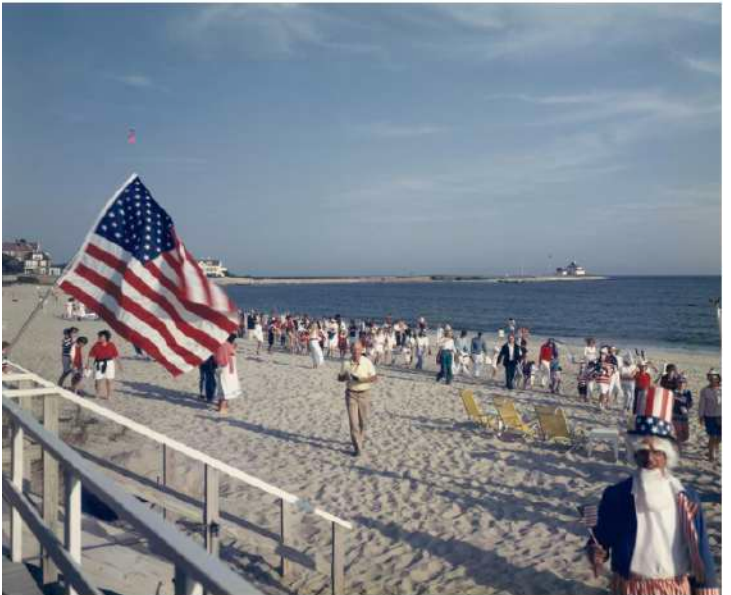
Tina Barney, 4th of July on Beach, 1989, chromogenic color print, 30 x 40".

I found myself in the shoes of a voyeur, visiting Tina Barney's landscapes here at night. Through the evening-lit gallery glass, the photographer's frozen frames of summer looked more sinister than they had during a daytime trip. Her seemingly clichéd pictures of the seasons as we see in works such as Drive-In 2017, Tennis Court , 1988, and 4th of July on Beach , 1989 are so obsessively formal that they bring out the shiver beneath nostalgia's blush. Barney serves up an ice-cream headache a sweet, saturated world in which one is constantly seduced by sumptuous details yet held at a chilly distance. But this only exacerbates the desire to enter the glistening reality of her prints. While the earliest work in the exhibition is from 1988, one would be hard-pressed to figure out the exact years all of her images were taken. Barney's photos feel impossibly consistent. It's as if linear time had collapsed into the blur of New England's collective memory, a kind of whitewashed forever. A departure from Barney's usual portraiture, the exhibition reveals a different aspect of the artist's practice one that's focused on outdoor space and the way its beauty reflects our values. Of course, like all pretty things, nothing is as harmless or as luxurious as it seems, and in the artist's landscapes one sees the way expectation laps away at the myth of the quaint Yankee beach town.