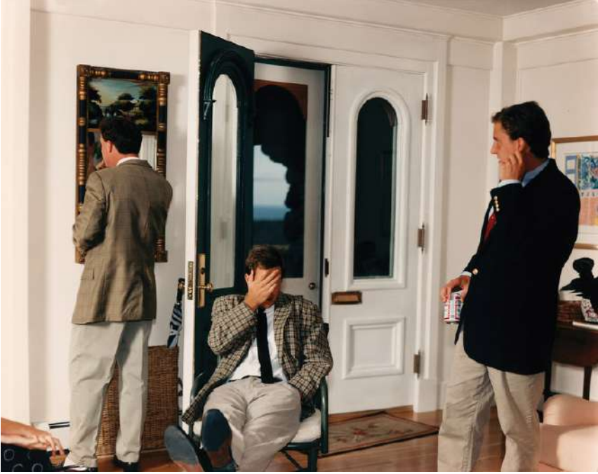
The Young Men, 1992.