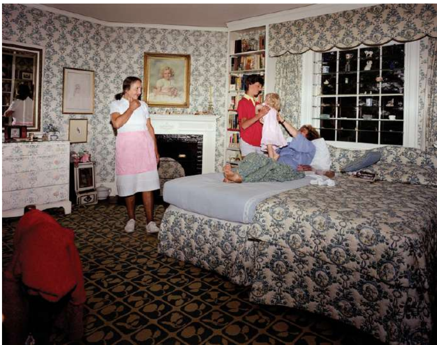
The Portrait, 1984.