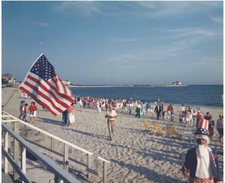
©Tina Barney, 4th of July on Beach, 1989. Courtesy Paul Kasmin Gallery

Tina Barney titled her exhibition, on view at Paul Kasmin Gallery until March 3, Landscapes . For a photographer known primarily for her photographs of human beings namely, of New England's upper crust this feels like a departure. But upon closer inspection which the large prints, taken with an 8×10-inch camera, invite the photographs are more about a slice of America's social landscape than a geographical one.