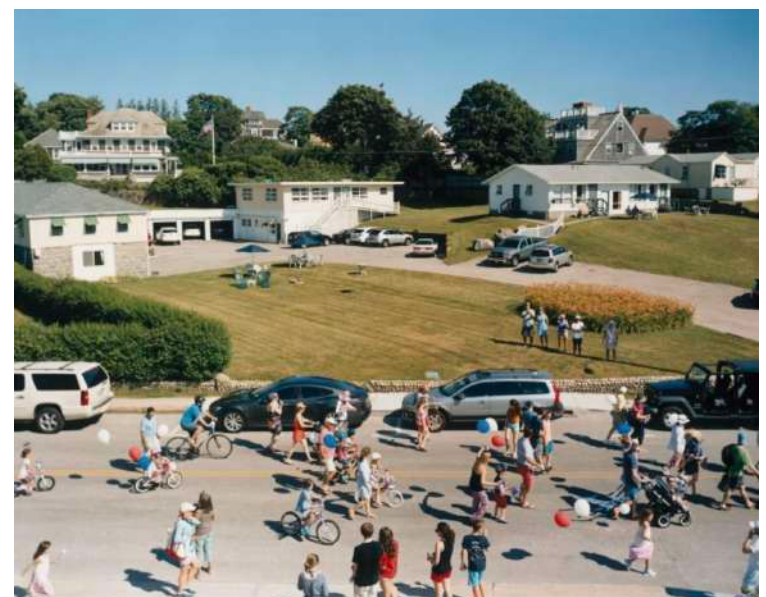
BIKE PARADE, 2017.

Tina Barney's photographs have an intimacy that displaces the viewer. Standing before one of her prints, one enters a paradox. Her subjects strangers, family, friends, artists are at once intensely close and impossibly distance as if the composition formed vitrine rather than a two-dimensional plane. This breakdown between subject and viewer is only intensified by the self-awareness of Barney's subjects who often stare directly into and seemingly through the lens.