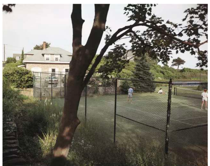
'Tennis Court' (1988)

Compiling her latest monograph, American photographer Tina Barney stumbled across some forgotten landscapes she had taken near her Rhode Island home in the 1980s. The discovery prompted Barney, famous for her tableau-style portraits of upper-class East Coasters, to exchange sumptuous interiors for the great outdoors. Last summer she spent weekends driving through New England, snapping verdant, sunny scenes with her 8x10 camera. Although expanding her field of vision, Barney's hallmark style remains. She captures candid moments between family and friends as well as what she calls "American traditional happenings" such as Fourth of July parades, high-school marching bands and drive-in cinemas. "I'm stretching the word 'landscape'. I was trying to get away from people, but I just can't resist having a few sprinkled in," she says.