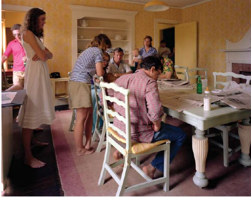
Sunday New York Times, 1982.