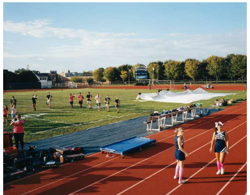
© Tina Barney Image courtesy of the artist and Paul Kasmin Gallery.

The places in Tina Barney's modest show of landscapes are easier to recognize than the year or even the decade in which the photographs were taken. The rocky beaches and white clapboard architecture in several scenes are identifiable as coastal New England, one of the insular communities (along with Manhattan and the south shore of Long Island) that she has mapped often during her career and claimed as her own material and emotional territory.