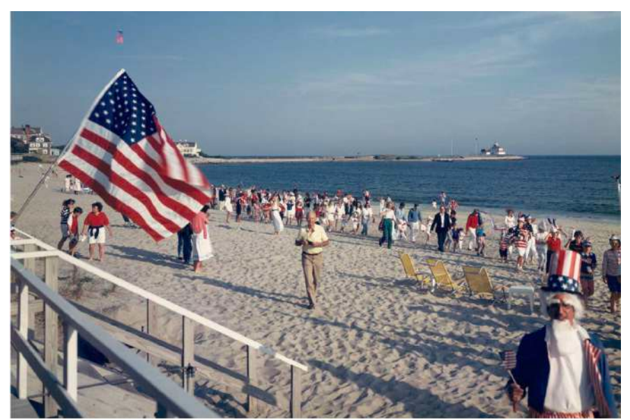
4th of July on Beach, 1989.

Tina Barney is known for her colorful, ultra-glamorous photographs of socialites and wealthy families, many of whom she met while growing up in New York City and Long Island. Last summer, for her latest project, the 72-year-old artist took her 8 x 10 camera outside to capture New England vistas. Her images of sandy beaches and quiet small-town streets are featured in the new exhibition "Tina Barney: Landscapes," opening today at Paul Kasmin Gallery in New York.