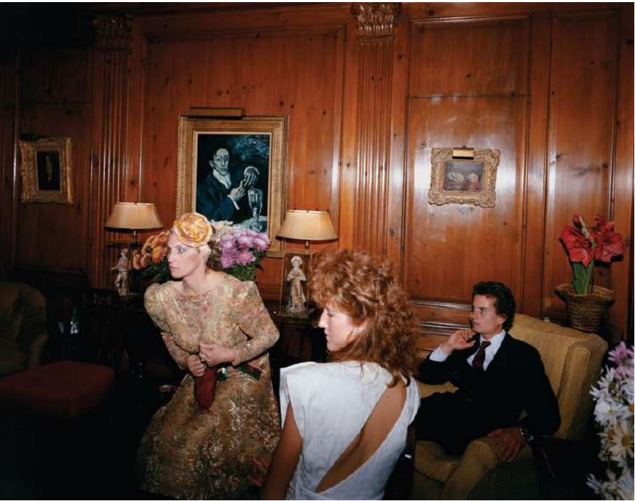
The Reception, 1985.

Looking back at that work from the mid-'70s through the early '90s, which collectively represents HOME, the opening section of the new book, she says: "The early pictures were very much more emotional, personal, and could never be replaced. They're so much about my life, my family, the people and houses that are important to me."