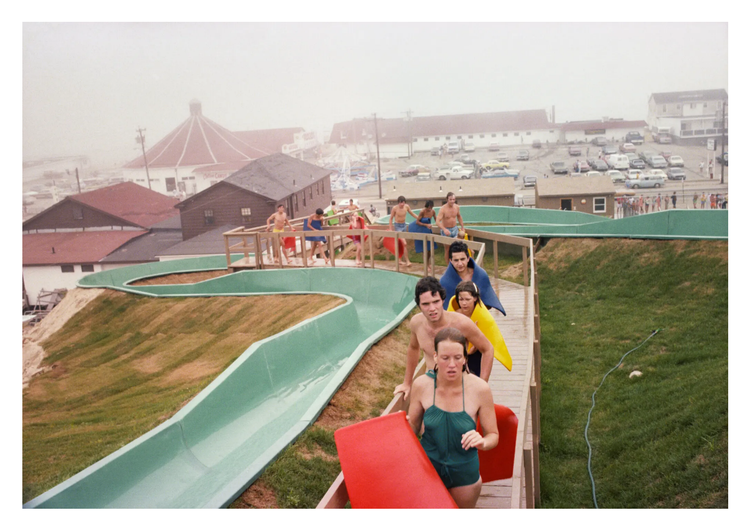
Tina Barney, "Waterslide in Fog," 1979.

In "Hot Tub" (1979), the face of a woman, topless in the water, is blocked by a wooden handrail jutting across the foreground, severing her from two background figures. In "The Art Gallery" (1980), a flower arrangement on a coffee table obscures a woman sitting on a sofa, while a man turns away and looks toward a painting. What could be viewed as compositional mistakes are the drama of these pictures — an off-balance quality that becomes a hallmark of later photos.