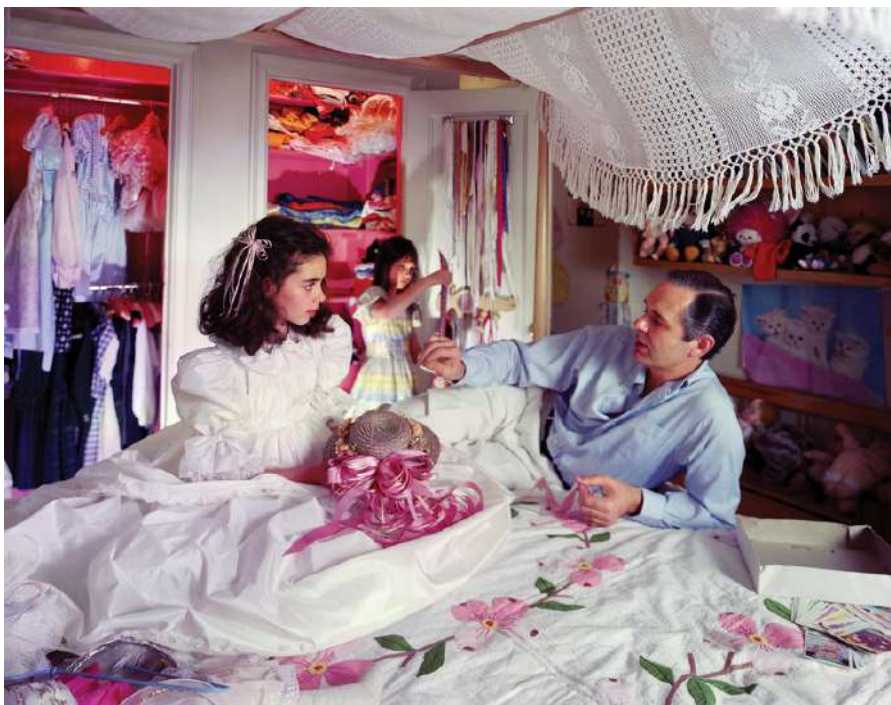
Marina's Room, 1987.