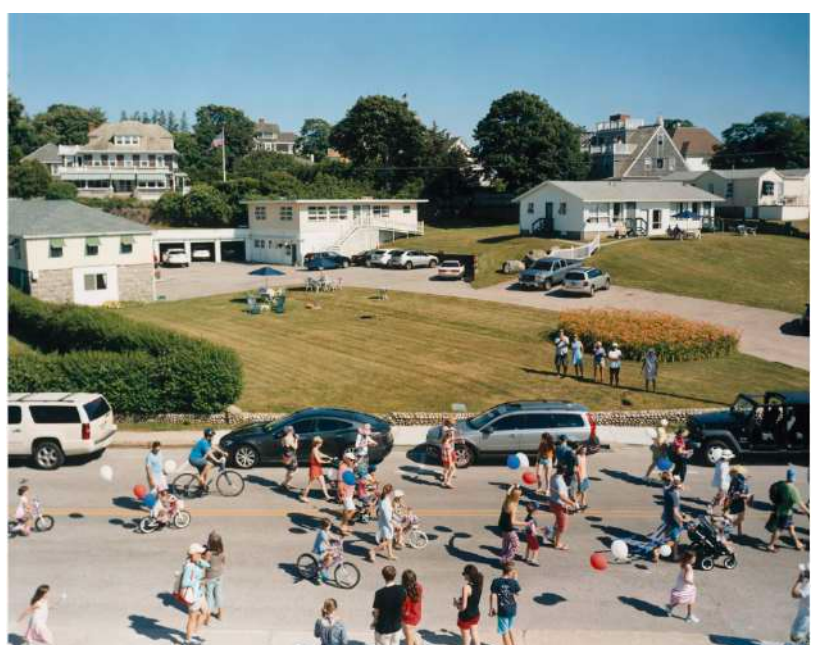
Tina Barney, "Bike Parade," 2017.

Tina Barney's new "Landscapes" series at Paul Kasmin Gallery shows another side of the American photographer's diverse body of work. Known for her extravagant portraits of the upper-class milieu, Barney instead focuses on suburban streets, beaches and architecture.